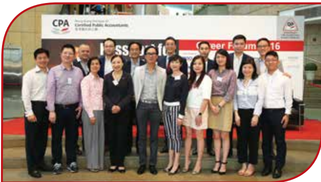
Over 700 QP and university students participated in the Career Forum 2016. Participants grasped the chance to mingle with CPAs and business leaders.