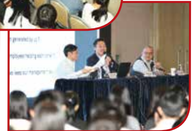
Participants attended career-oriented workshops and grasped the chance to seek advices from the renowned speakers.