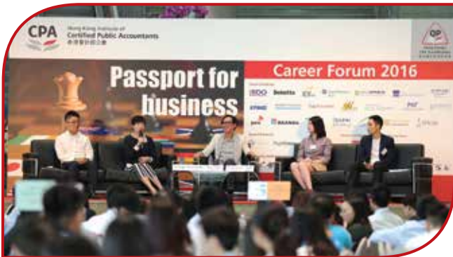
Panelists shared their professional experiences and tips to develop a successful career with the participants at the Career Forum 2016.