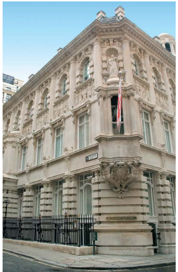
Chartered Accountants' Hall, headquarters of the ICAEW – built in 1890 by subscription of our members