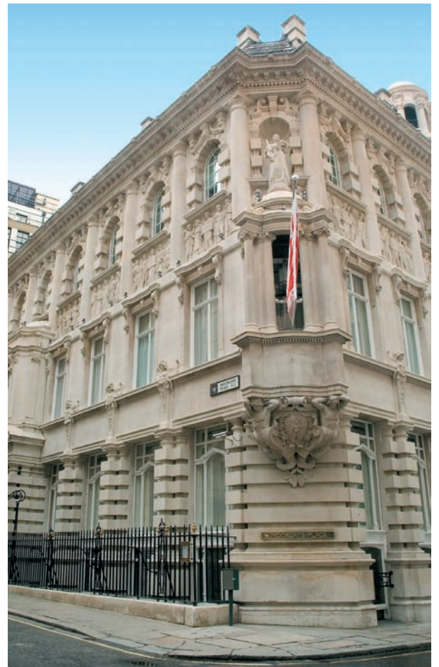
Chartered Accountants' Hall, headquarters of the ICAEW – built in 1890 by subscription of our members