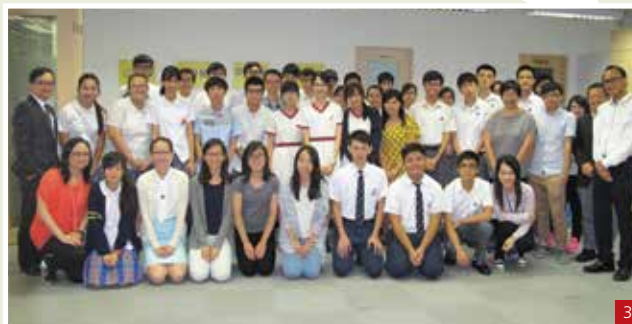
Group photo at International Housewares Retail Company Limited