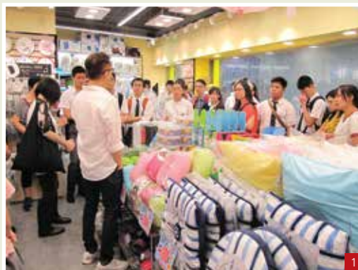
Students visiting one of the JHC concept stores

HKICPA organizes a series of activities for students during the summer. On 11 August 2016, finalist teams of the accounting and business management case competition 2015-2016 and a group of secondary school students visited International Housewares Retail Company Limited (JHC), the selected company for case study in the competition. The visit is part of the learning activities followed by the competition. In addition to a visit to the JHC's headquarter, participating students had an opportunity to join a guided tour to its concept shop and warehouse as well so as to understand the business operation of a company in real life.