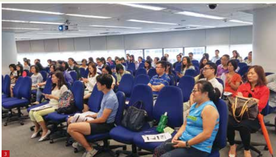
BAFS teachers joining the seminar and finding the seminar very useful for enriching their knowledge