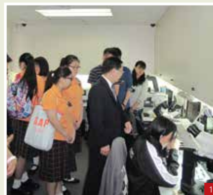
Students visiting Luk Fook and its China Gems Laboratory

HKICPA organizes a series of activities for students during the summer. On 27 July 2015, finalist teams of the accounting and business management case competition 2014-2015 and a group of secondary school students visited Luk Fook Holdings (International) Limited, the selected company for case study in the competition. The visit is part of the learning activities followed by the competition. Participating students had an opportunity to visit Lukfook's China Gems Laboratory (中華珠寶鑑定中心) and understand the business operation of a company in real life.