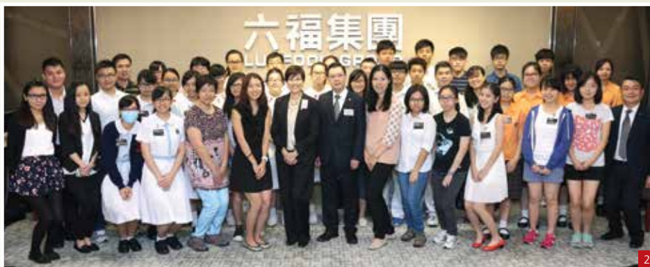
Students visiting Luk Fook and its China Gems Laboratory