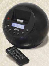
eBOX Model no.: OHM-1622