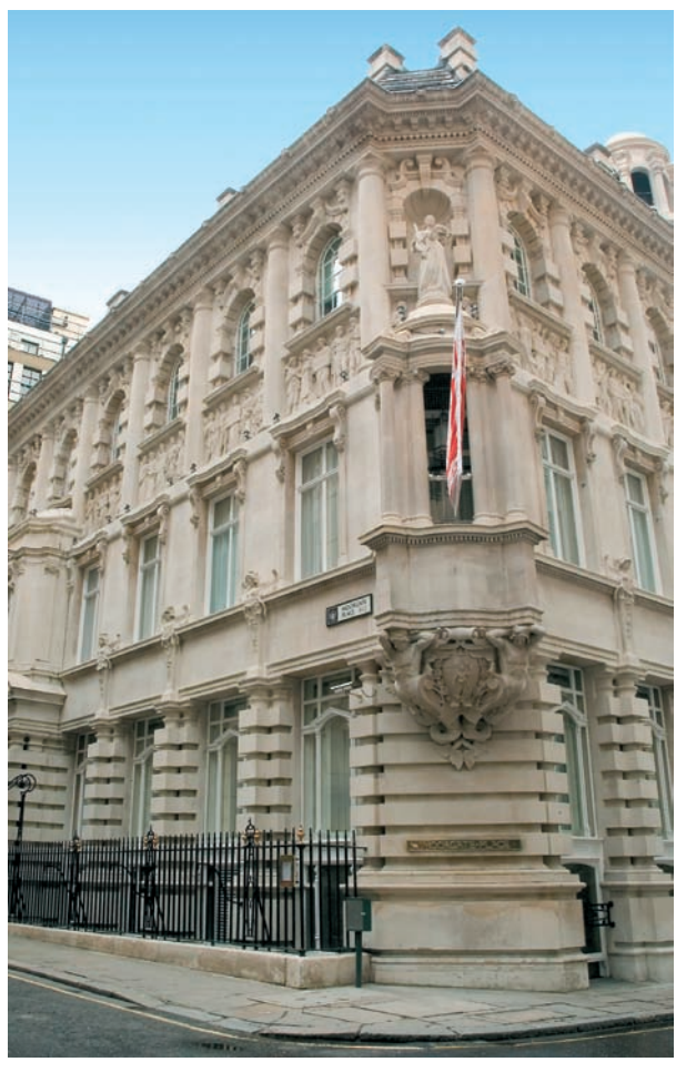
Chartered Accountants' Hall, headquarters of the ICAEW – built in 1890 by subscription of our members

Arthur Cooper 1883-1884 William Welch Deloitte 1888-1889 Edwin Waterhouse 1892-1894 Ernest Cooper 1899-1901 William Barclay Peat 1906-1908