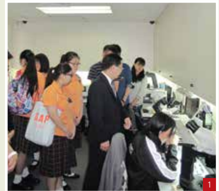
Students visiting Luk Fook and its China Gems Laboratory

HKICPA organizes a series of activities for students during the summer. On 27 July 2015, finalist teams of the accounting and business management case competition 2014-2015 and a group of secondary school students visited Luk Fook Holdings (International) Limited, the selected company for case study in the competition. The visit is part of the learning activities followed by the competition. Participating students had an opportunity to visit Lukfook's China Gems Laboratory (中華珠寶鑑定中心) and understand the business operation of a company in real life.