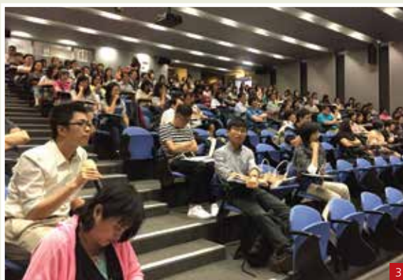
BAFS teachers joining the seminar and finding the seminar very useful for enriching their knowledge