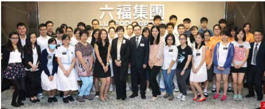
Students visiting Luk Fook and its China Gems Laboratory