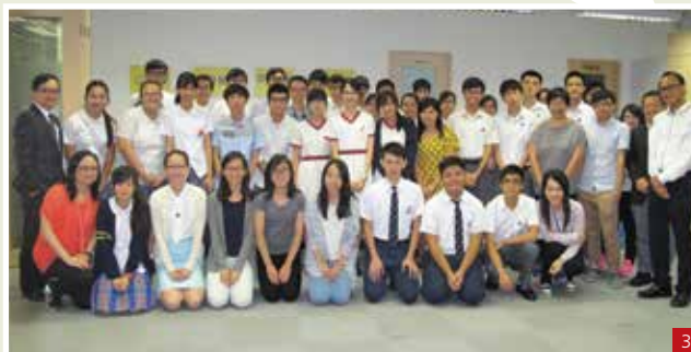
Group photo at International Housewares Retail Company Limited