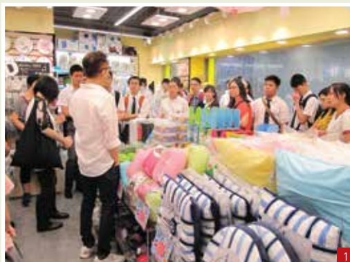
Students visiting one of the JHC concept stores

HKICPA organizes a series of activities for students during the summer. On 11 August 2016, finalist teams of the accounting and business management case competition 2015-2016 and a group of secondary school students visited International Housewares Retail Company Limited (JHC), the selected company for case study in the competition. The visit is part of the learning activities followed by the competition. In addition to a visit to the JHC's headquarter, participating students had an opportunity to join a guided tour to its concept shop and warehouse as well so as to understand the business operation of a company in real life.