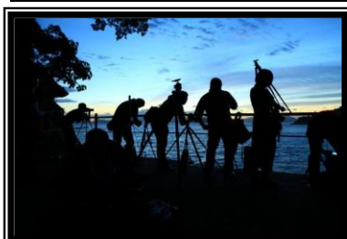
Hide n" Seek