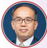
Mr. Christopher Hui, GBS, JP Secretary for Financial Services and the Treasury The Government of the Hong Kong Special Administrative Region

09:30 Panel discussion 1: Embracing sustainability, ESG and green finance – An option or prerequisite for CPAs and businesses?