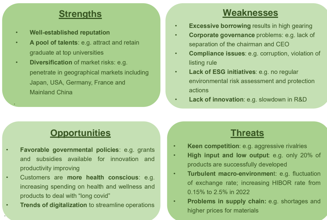
Table 1: SWOT Analysis

make a strategic move to digitalize its operation. A summary of SWOT analysis is shown in Table 1.