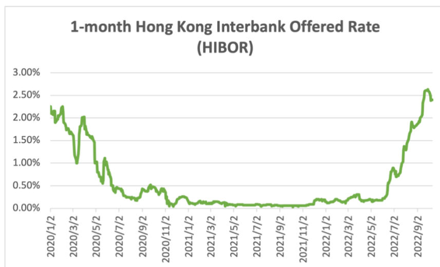
Table 3: 1-month Hong Kong Interbank Offered Rate from 2020 to 2022

Currently, Galaxy takes a passive role in dealing with interest rate risks. In 2021, the one-month HIBOR has risen to 2.5% (as presented in the table 3), resulting in increase in finance cost. The following table show the unfavorable movement of interest rate in prior two years: