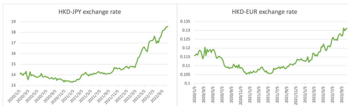
Table 4: exchange rate between HKD and JPY, EUR

Recommendation: To solve the problem, Galaxy is advised to use appropriate measures enabled by its treasury functions, such as netting and hedging (to be discussed in section 3.3). In addition, Galaxy can avoid the foreign exchange by invoicing its foreign industrial customers using Hong Kong Dollars (HKD).