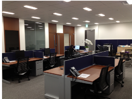
↓ Staff room