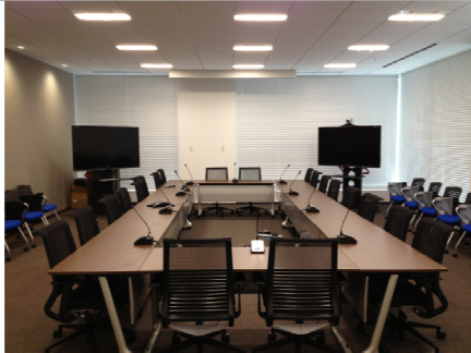
← Conference room