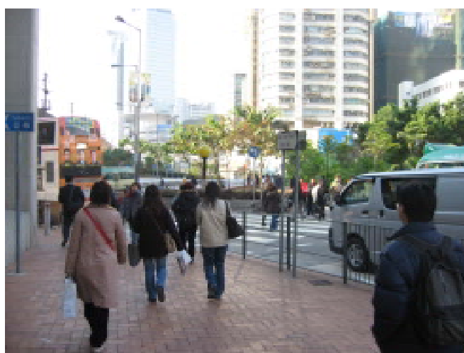
4. Walk about 30 steps and you will see the zebra crossing, then turn right