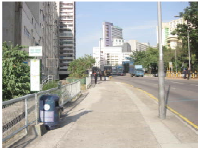
16. Go straight along the road