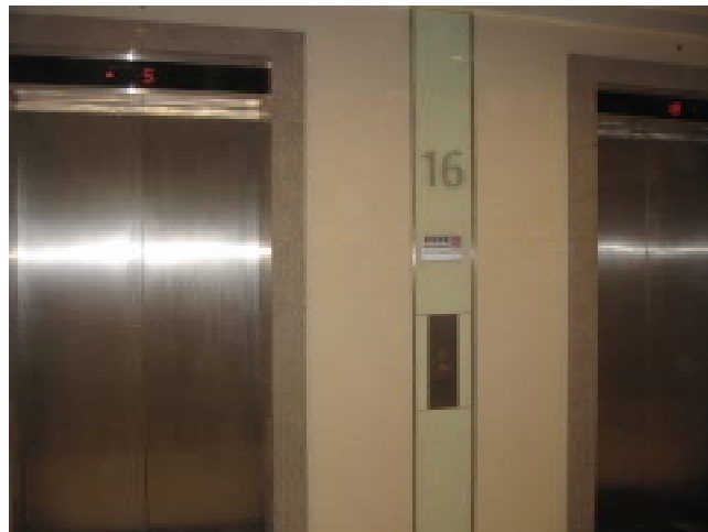
21. Leave from the lift on 16/F