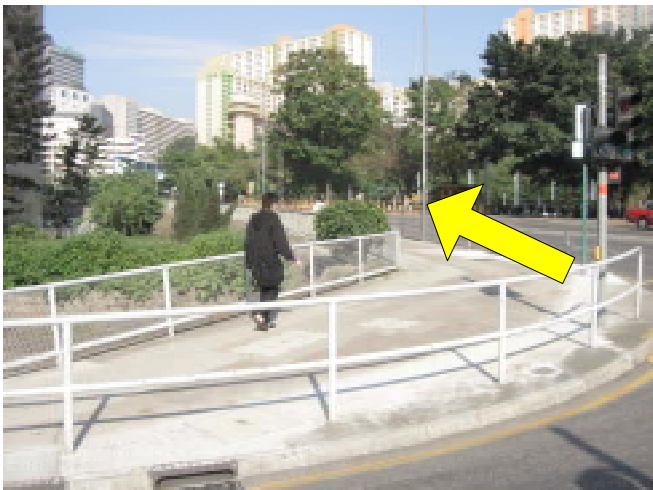
15. Then walk straight after leaving the footbridge to the brae