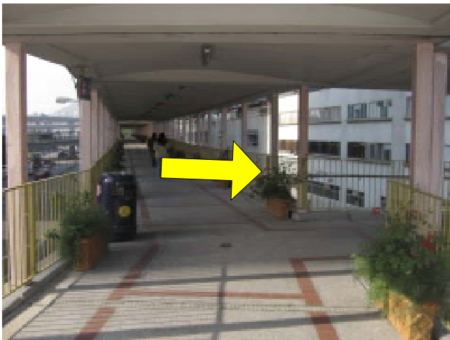
13. Turn right when you reach the exit of the footbridge on your right