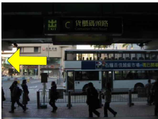
3. Turn left when you reach Exit "C"