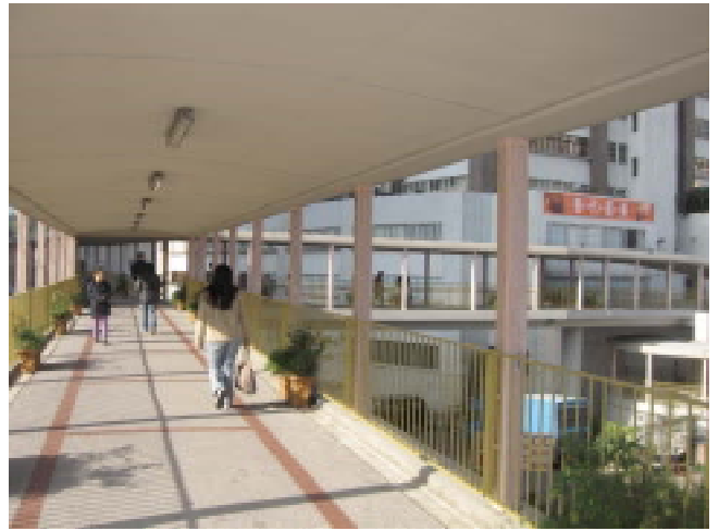
12. Then walk straight on the footbridge