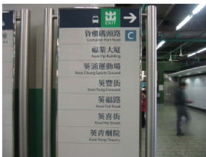
2. Take Exit "C" for Kwai Hei Street