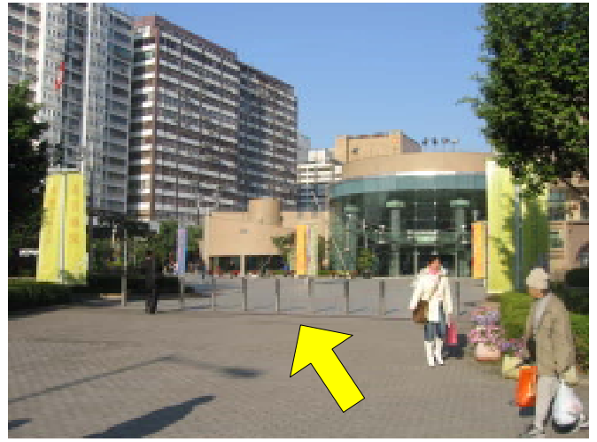
6. Go straight and you will see Kwai Tsing Theatre