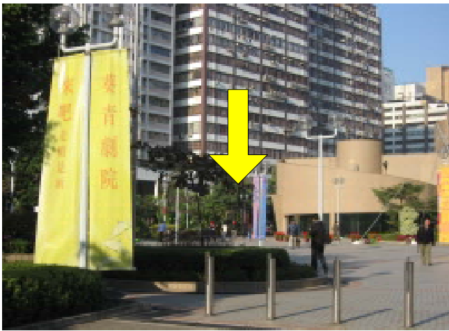
7. Then walk straight on your left