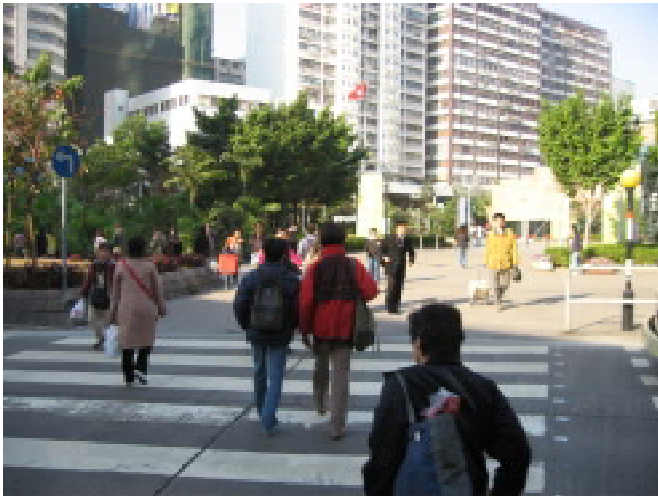
5. Then walk across the zebra crossing