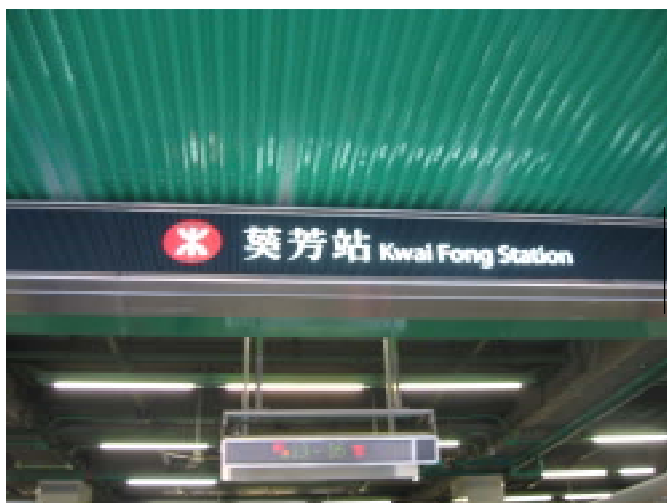
1. Kwai Fong MTR Station

16 th Floor, Metro Loft, 38 Kwai Hei Street Kwai Chung, Kowloon Tel : (852) 2736 2083