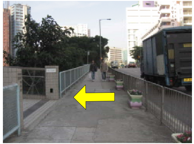
18. After walking for another 2 mins, you can see the footbridge linking to Metro Loft on your left