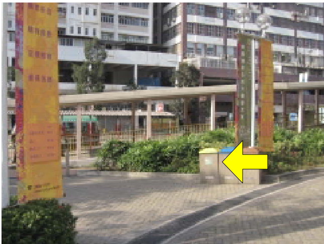
9. Turn left when you see the footbridge