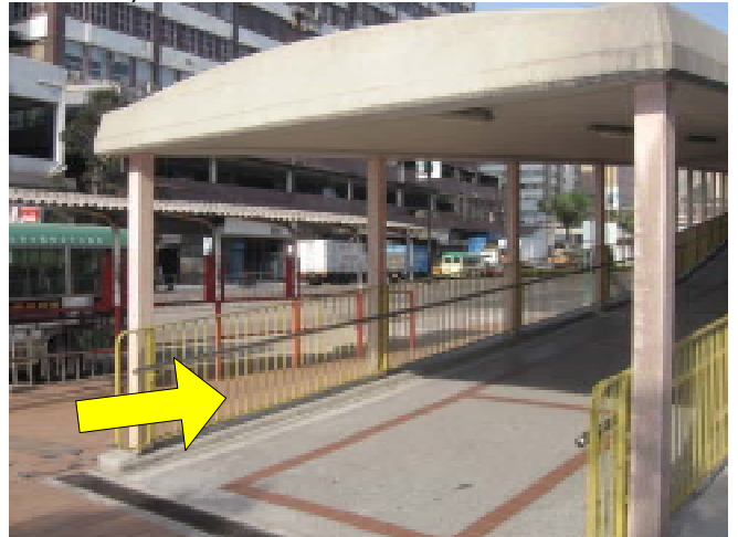
10. Then walk up to the footbridge