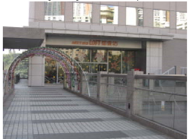
20. Walk straight to the entrance and take the lift to 16/F