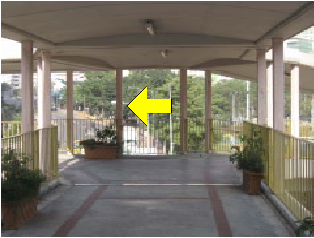
11. Turn left when you reach the end of the footbridge