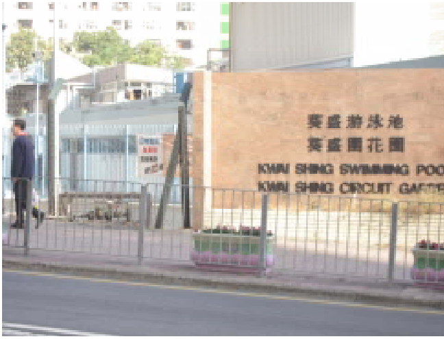
17. You can see Kwai Shing Swimming Pool on your right after walking for 3 mins