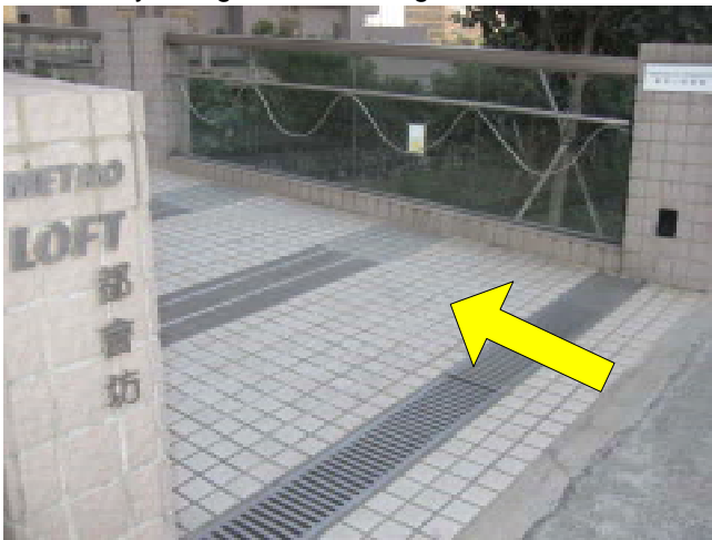
19. Then Turn left