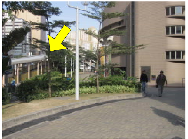
8. Walk about 150 steps and you will see footbridge on your left.