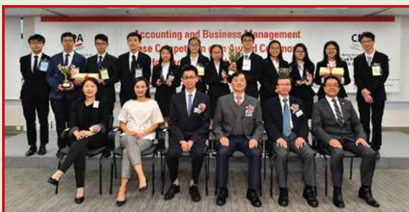
8 Winning teams with honourable guests