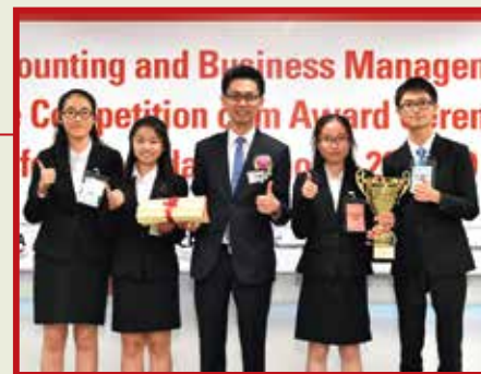
5 Champion and Best Proposal Award winner