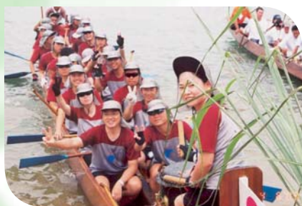
The Society's Dragon Boat/Water Sports Interest Group participated in the Discovery Bay Dragon Boat Races. (June 2003) 公會的龍舟/水上活動興趣小組參加愉景灣龍舟競渡。 (二零零三年六月)