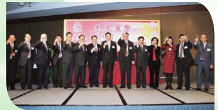
The Hon. Frederick Ma, Secretary for Financial Services and the Treasury, toasted with Council members at the Society's Spring Cocktail Reception. (February 2003) 財經事務及庫務局局長馬時亨在公會的春節酒會上與公會理事會杯慶祝。(二零零三年二月)