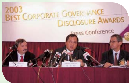
The launch press conference of the Best Corporate Governance Disclosure Awards 2003. (June 2003) 二零零三年度最佳公司管治資料披露大獎舉行新聞發布會。 (二零零三年六月)