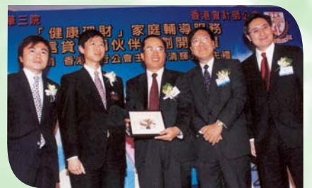
The Society launched the "Creditors Partnership Scheme" jointly with the Tung Wah Group of Hospitals and a number of major banks to help the debt-ridden members of the public. (March 2003) 公會與東華三院及多家大型銀行聯手推出「信貸機構伙伴計劃」，幫助社會上有沉重債務負擔的人士。(二零零三年三月)