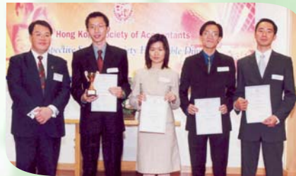
Prize presentation of the First Qualification Programme Case Analysis Competition organised by the Society's Prospective Students Society (PSS). (November 2002) 由公會Prospective Students Society舉辦的首屆專業資格課程個案分析比賽進行頒獎典禮。(二零零二年十一月)