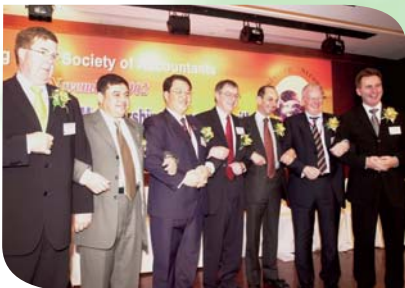
HKSA signed Reciprocal Membership Agreements (RMA) with six premier international chartered accountancy institutes during the 16th World Congress of Accountants. (November 2002) 公會於第十六屆世界會計師大會期間與六個國際特許會計師公會簽訂相互互籍認可協議。(二零零二年十一月)