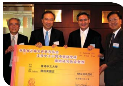
The President presented a cheque for $600,000 to the Institute of Chinese Medicine, the Chinese University of Hong Kong, to sponsor its research on the anti-viral drink powder to fight against Sars. (September 2003) 公會會長向香港中文大學中醫藥研究所捐贈600,000元支票，資助其研究對抗非典型肺炎之防災製劑。(二零零三年九月)