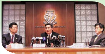
Press conference on the Society's proposals to enhance regulatory independence and accountability. (December 2002) 公會舉行有關加強監管獨立性及問責性建議的新聞發布會。(二零零二年十二月)