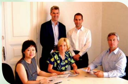
The Society signed two milestone licensing agreements with the Canadian Institute of Chartered Accountants and the American Institute of Certified Public Accountants during the International Innovation Network (IIN) meeting in Rome. (July 2003) 公會於羅馬參加專業創新國際互聯網組織(IIN)會議期間，與加拿大特許會計師公會及美國執業會計師公會簽訂兩項重要的授權協議。 (二零零三年七月)