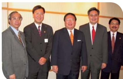
The President, Chairman and Deputy Chairman of the Community Services Committee and the Registrar met with the Secretary for Home Affairs Dr. Patrick Ho (middle). (June 2003) 公會會長、社會義務工作委員會主席、副主席及公會註冊主任會晤民政事務局長何志平博士(中)。(二零零三年六月)