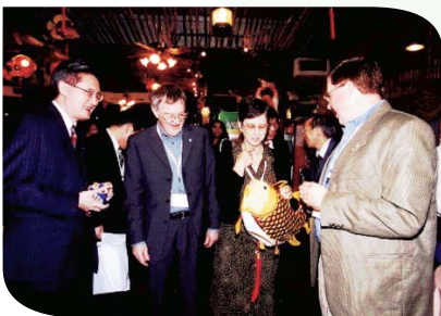
The Society hosted a dinner gathering for CAPA representatives during the 16th World Congress of Accountants. (November 2002) 公會於第十六屆世界會計師大會期間，舉行晚宴款待亞太區會計師聯會代表。(二零零二年十一月)