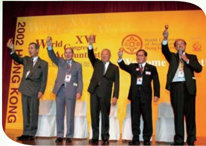
The HKSAR Chief Executive Tung Chee Hwa (centre) officiated at the Opening Ceremony of the 16th World Congress of Accountants. (November 2002) 香港特區行政長官董建華(中)主持第十六屆世界會計師大會的開幕典禮。(二零零二年十一月)