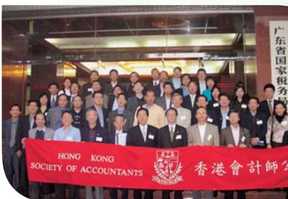
Representatives of the Society's Mainland Business Interest Group visited the Guangdong Provincial State Taxation Bureau. (December 2002) 公會中國大陸業務關注組的代表探訪廣東省國家稅務局。(二零零二年十二月)