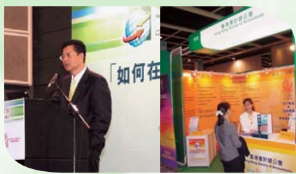
The Vice-President Paul Chan participated in the SME Market Day organised by the Trade Development Council. (June 2003) 公會副會長陳茂波參加貿易發展局主辦的中小企市場推廣日。 (二零零三年六月)