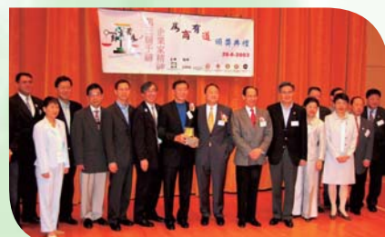
The President attended the prize presentation ceremony of the Millennium Entrepreneurship Programme organised by the Hong Kong Youth Institute. (June 2003) 公會會長出席香港青年學院的「千禧企業家精神」計劃頒獎典禮。 (二零零三年六月)