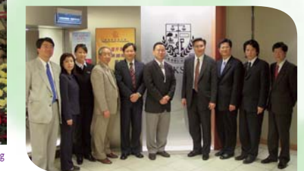
The Society's representatives received a delegation comprising members of various small and medium enterprises and trade associations in Hong Kong. (April 2003) 公會代表接待本港多家中小型企業和商會的成員代表。(二零零三年四月)