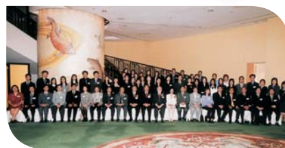
The Society's 2003 Annual Award and Graduation Ceremony. (September 2003) 公會舉行二零零三年度周年頒獎暨畢業典禮。(二零零三年九月)