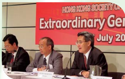
The President chaired the Extraordinary General Meeting on the amendment to the Professional Accountants Ordinance and By-laws. (July 2003) 公會會長主持有關修訂《專業會計師條例》及附例的特別大會。 (二零零三年七月)